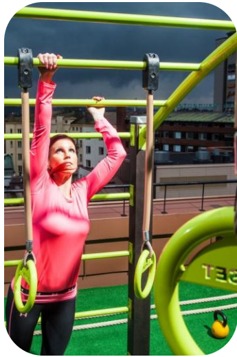
Fitness & Gym