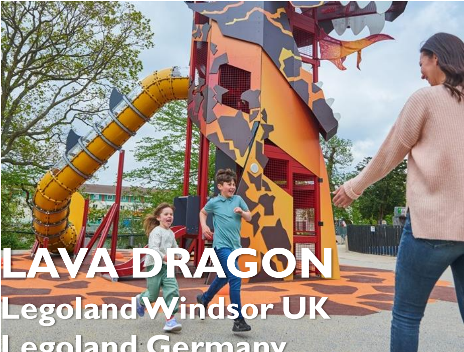
LAVA DRAGON Legoland Windsor UK Legoland Germany