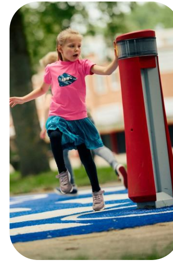
Interactive play & sport